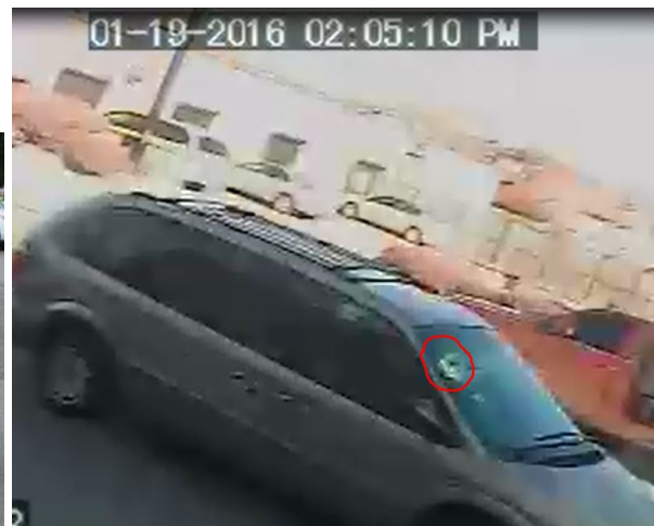
Actual Wanted Vehicle

The Major Accident Investigation Section encourages anyone who may have witnessed or may have any information about this crash to contact this investigative unit at 312-745-4521