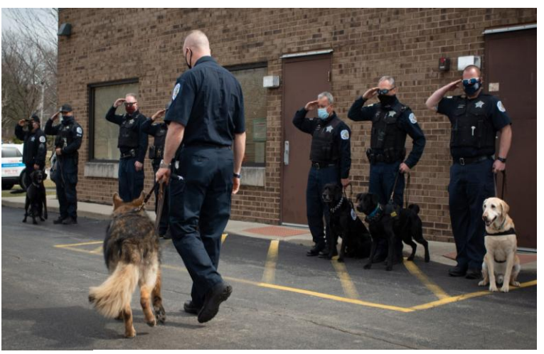
CPD's Graphic Arts section was nominated for an Emmy for their video "<u>Honoring Canine Domi</u>"

courageously serving this city during the COVID-19 pandemic. These heroes gave their lives in service of others, and we will carry on the legacies of bravery, commitment every one of these officers have left behind.