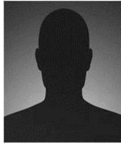
Female Juvenile, 17