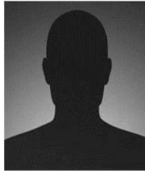
Female Juvenile, 17