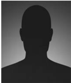
Male Juvenile, 16