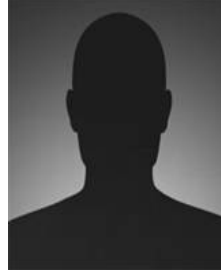
Male Juvenile, 17